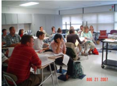
New teachers during summer training days.