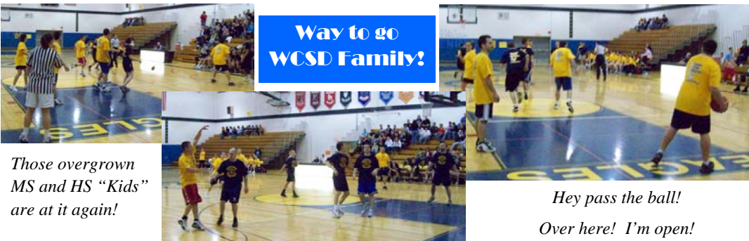
Way to go WCSD Family!