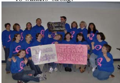
Team Becker get’s down— 18 walkers strong!