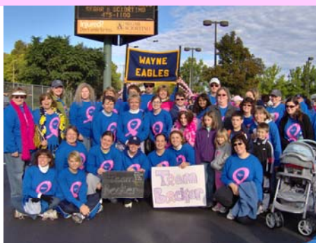
On the move—to cure Breast Cancer!